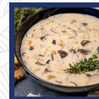
Cream of Mushroom Soup