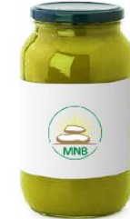
Mushroom & Isombe Sauce