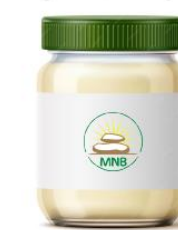
White Cream Sauce