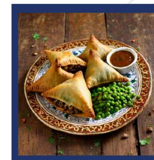
Mushroom & Vegetable Sambusa